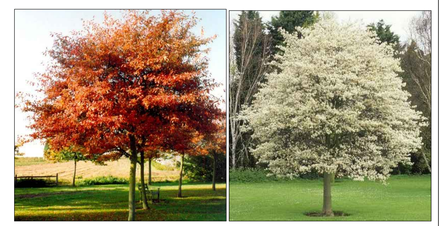
FEATURE TREE - Amelanchier lamarckii